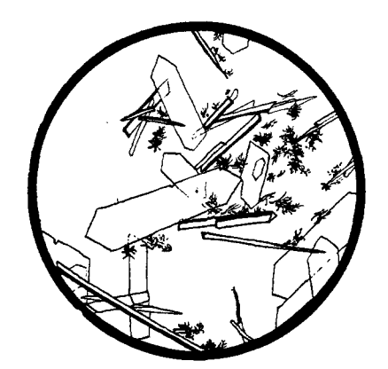
Fig. 3.—Hexagonal crystals of the hydrate of the colorless acid with hydrated needles of the yellow acid and some colorless acid ( \times 30).